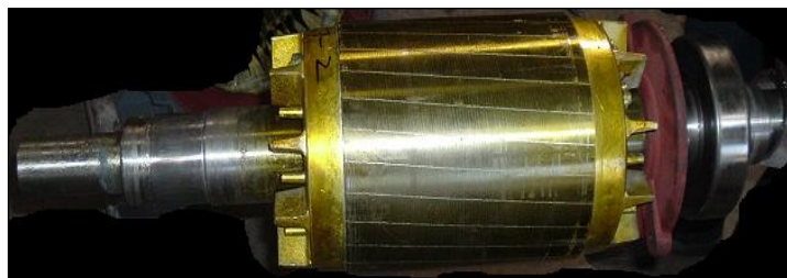
4140 Tensile Steel Shaft